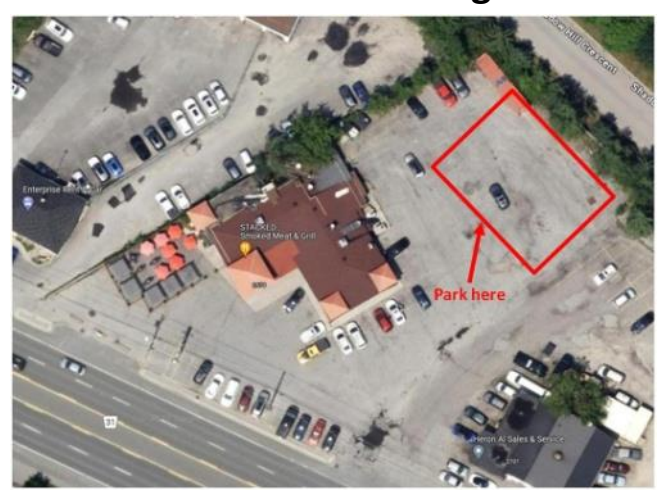
Park cars at Stacked where shown so as not to interfere with other patrons: