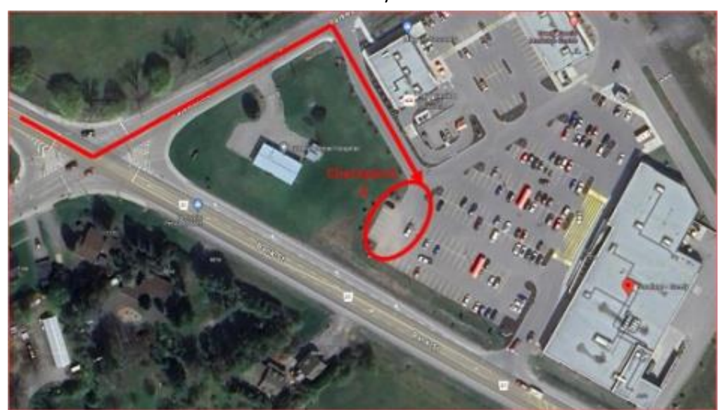
B To the right of Tim Horton's 989 River Road Manotick

A Across from Foodland 6045 Bank St. Greely