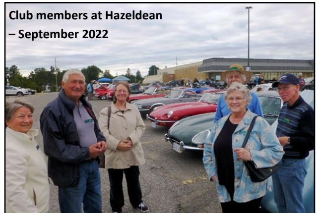
Club members at Hazeldean – September 2022