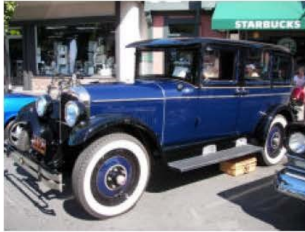
1928 Nash: Paddy's personal favourite

There were few British cars on display—a Morgan, a few Jags, a few Morris's, the usual MG's and Triumphs, and a multitude of American-made classics. The Cadillac line-up took up a whole block!