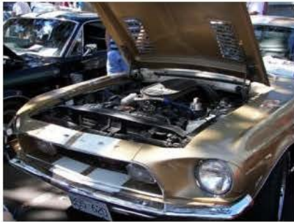
1968 Shelby Cobra—it looks its age, but still very nice.