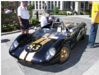
This spotless 1963 Lotus 23B was Swiss National Champion.