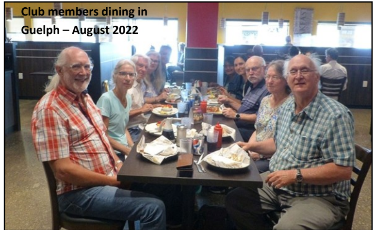
Club members dining in Guelph – August 2022

6) Cooperative and collaborative events at Jaguar dealer sites, including at least one commemorative gala event featuring the 75 th anniversary of the announcement of the XK120.