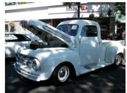
1952 Chevy 210—a very well-preserved utility vehicle.