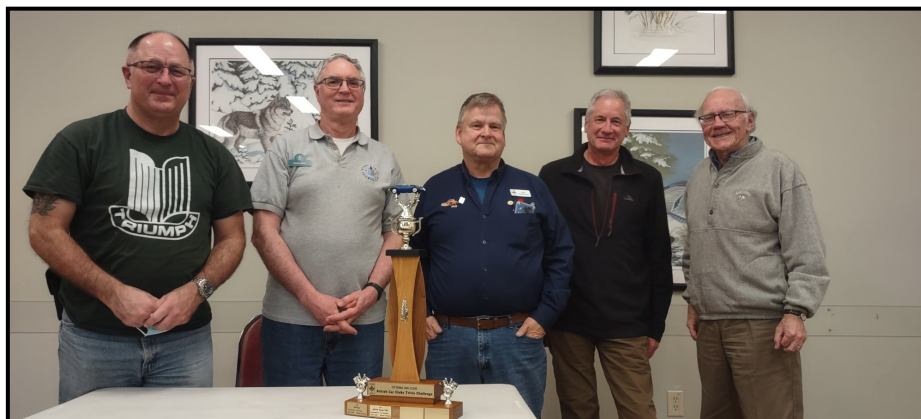
The Triumph club's winning team:

If you think that you would enjoy a light hearted and fun afternoon as we head into winter, you should consider joining in next year to help represent your club.