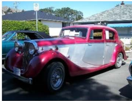
Above: This 1948 1-1/2 litre Jaguar MK IV has a Mustang engine, transmission and frame. Not even the paint is standard. It is but a shell of its former self!