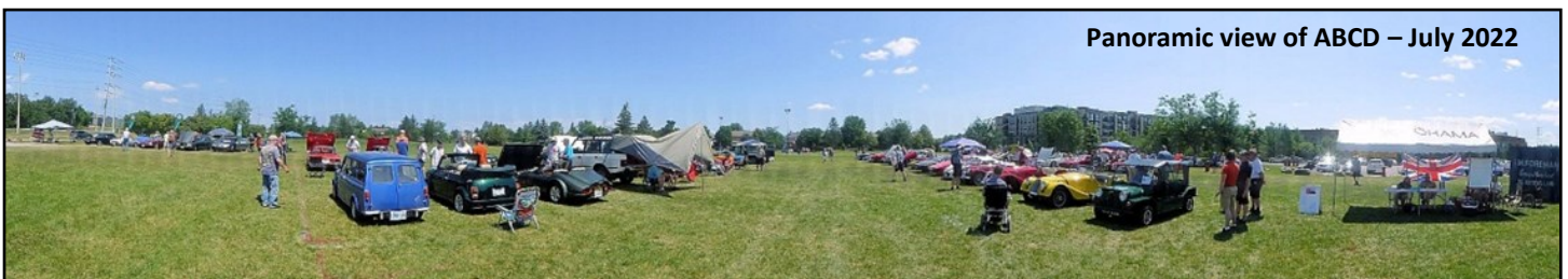
Panoramic view of ABCD – July 2022

Please contact Alan Graves with your ideas and your offers of help. at gravesal76@rogers.com .