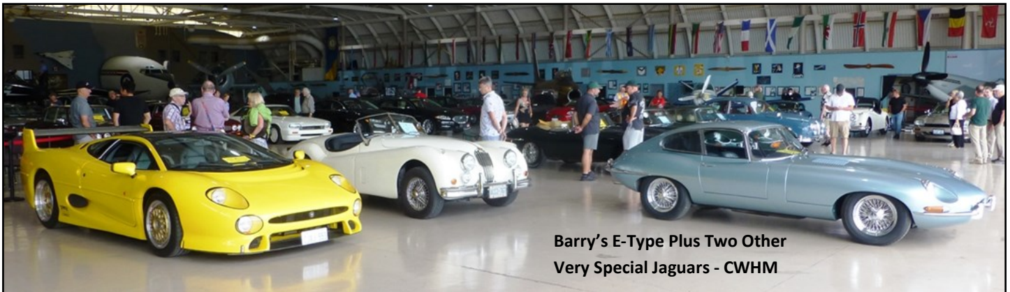
Barry's E-Type Plus Two Other Very Special Jaguars - CWHM