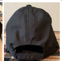
6 Colours available

Firsten adult brushed cotton ball cap. It feels good and is adjustable. The logo will be the Ottawa Jaguar Club as seen up below. AJM poly ripstop ball cap. A comfortable cap with good air transfer through the back.