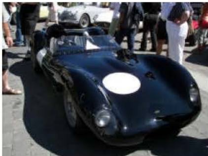
A 1960 Lola MK 1, one of 39 built... and it's not in Phil Karam's collection!