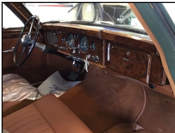
The immaculate interior restored by the Guild in Bradford, Ontario