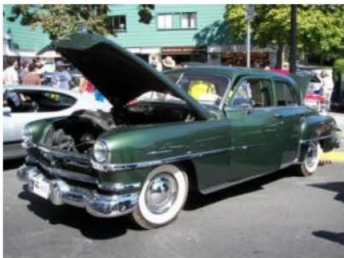
1951 Chrysler Windsor: gorgeous!