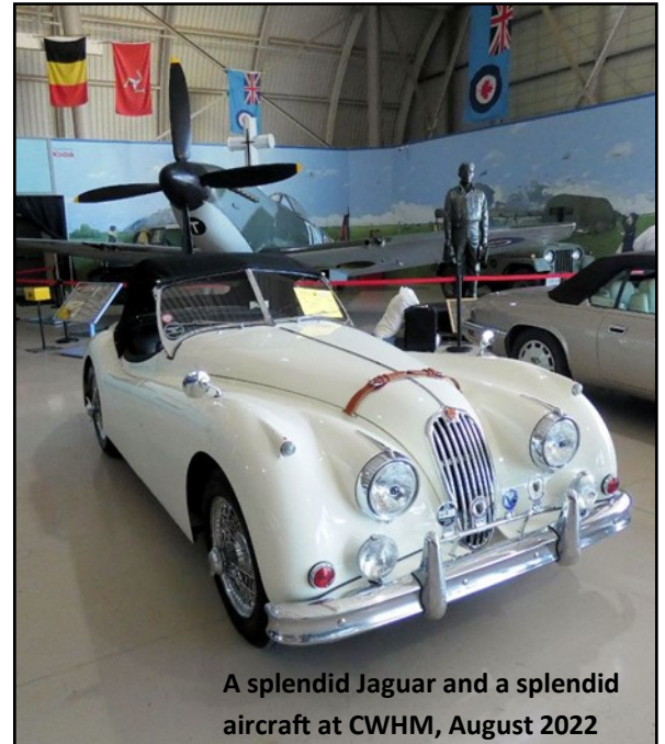
A splendid Jaguar and a splendid aircraft at CWHM, August 2022

With the first snowfall of winter 2022-23 bringing a close to our 2022 events season we can both look back at this year's events season and forward to 2023. The 2022 season featured the first full slate of events since 2019 and the start of the pandemic, the 2021 season being significantly disrupted by that pandemic. The 2022 season offered a veritable smorgasbord of events – drives, shows, weekend trips, interaction with other clubs, social events and so on – but was marked by a massive lack of member participation. For instance the 2014 Concours attracted 50 Jaguars, our 2022 Family Day well under 20. A similar lack of participation and of volunteering has been reported by multiple other clubs and organizations so we are definitely not alone in facing this issue. Hopefully this lack of support is a temporary aftermath of the pandemic but there is a risk that it is more than this. And the situation is becoming urgent since the existing event organizers and volunteers generally have been at this for a long time, are aging, retiring from active driving and need to be replaced by new, younger blood or things will grind to a halt.