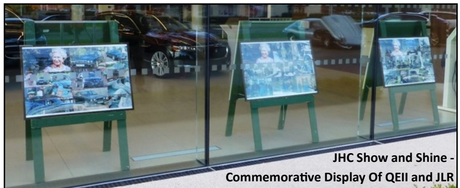
JHC Show and Shine - Commemorative Display Of QEII and JLR

The 2023 program definition and development is in its early stages and we are actively seeking your suggestions and indications of what you would participate in or volunteer to run. Currently we are looking at a balanced program of short, medium and long drives, club shows and trips to shows and competitive events, weekend trips to places and events of interest, joint events with the Jaguar dealers, some form of technical program, regular club meetings every couple of months or so and more.