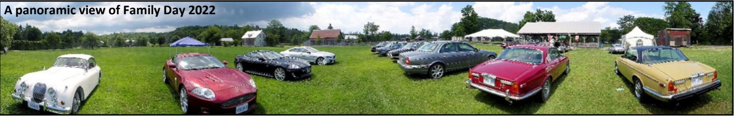
A panoramic view of Family Day 2022