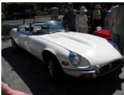
1972 E-type, Series 3, V12