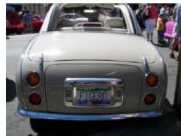
This 1991 Nissan Figaro looked old-fashioned! Truly unusual (to us). It is one of a series of retro styled vehicles produced between 1987 and 1991.