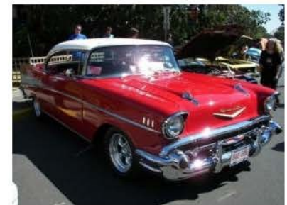
1957 Chevrolet Belair