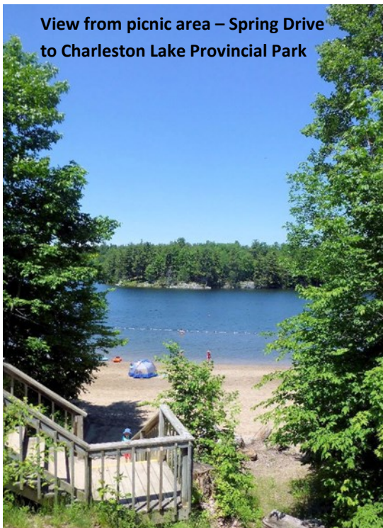
View from picnic area – Spring Drive to Charleston Lake Provincial Park

7) Social events and club meets, including a spring and Christmas dinner, at least one barbecue, and bi-monthly meetings featuring a speaker or some other focal point plus a chance for members to interact with the club leaders. Again event leaders and volunteers are needed.