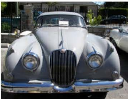
1959 XK150 in prime condition.